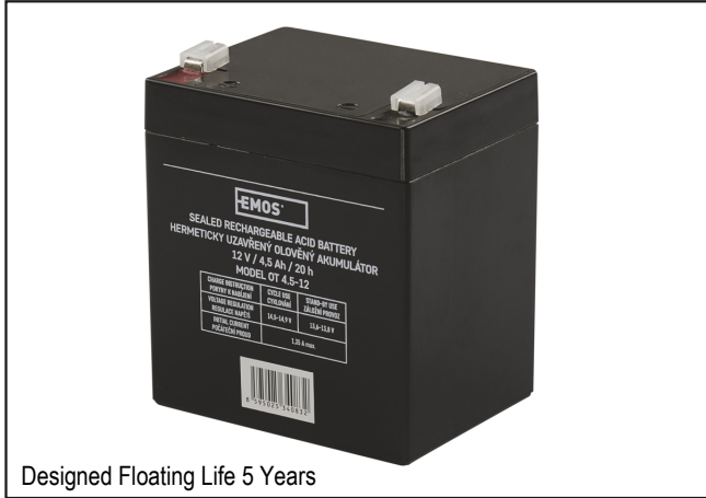
Designed Floating Life 5 Years

Operating Temp. Range: Discharge : -15 – 50°C (5 120°F); Charge : 0 – 40°C (5 104°F); Storage: -15 - 40°C (5 104°F)